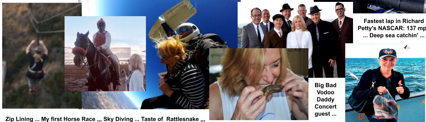
Zip Lining ... My first Horse Race ... Sky Diving ... Taste of Rattlesnake ...

P.S. ... and when I'm not working, I've been turning some of my "bucket list" thoughts into actual experiences: